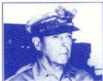
General Douglas MacArthur