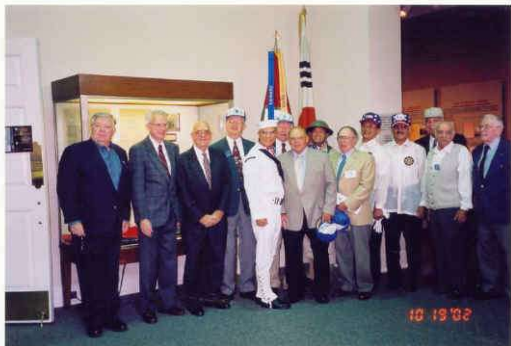
Deadeyes with Filipino American Color Guard in front of Division And South Korean Flags